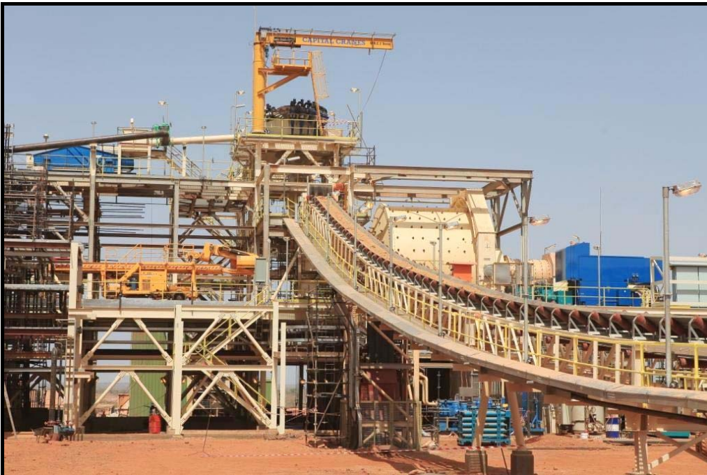
The plant has comfortably exceeded the nominal two million tonnes per annum throughput rate