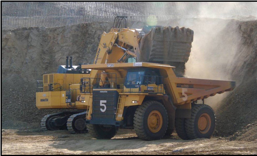
Open pit showing 27 tonne shovel loading 100 tonne capacity truck