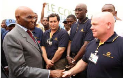
His Excellency, Abdoulaye Wade, President of the Republic of Senegal, meets SGO staff