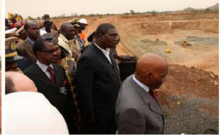
The President inspects the Sabodala pit