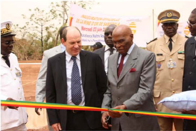
Official opening at the Sabodala gold mine