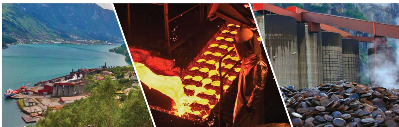
TiZir Titanium & Iron ilmenite upgrading facility, Tyssedal, Norway

Note: 4Q 2015 and 4Q 2016 production performance was impacted respectively by the furnace reline and capacity expansion project in 2015 and repairs following an operational incident in August 2016.