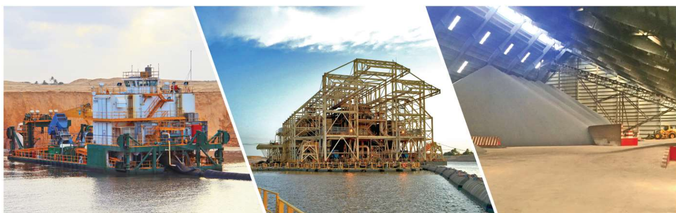
Grande Côte mineral sands operation, Senegal, West Africa

GCO achieved its second consecutive quarter of positive cash flows in 4Q 2016 as a result of increasing sales volumes, the ongoing impact of cost reduction initiatives and working capital management. Further, GCO was cash flow positive for 2016, representing the first year of annual positive cash flows for the operation since commencement of production in 2014.